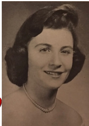
1957 high school photo